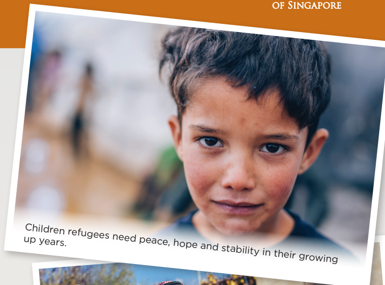
Children refugees need peace, hope and stability in their growing up years.

Alongside the many other projects we support to bless the needy in the region, the Bible Society is raising