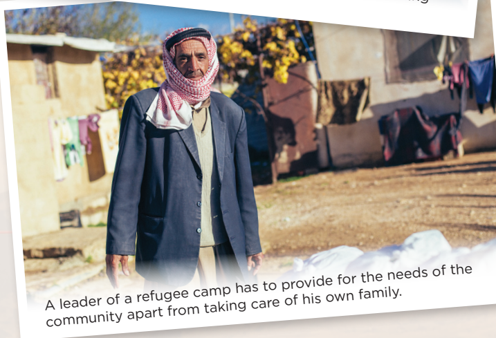
A leader of a refugee camp has to provide for the needs of the community apart from taking care of his own family.

awareness to help the plight of refugees. Apart from encouraging them with basic necessities and Scriptures, we hope to meet the educational needs of children refugees and families through SAT-7 KIDS — a Christian satellite television that makes learning possible for many who are unable to go to school in the Middle East.