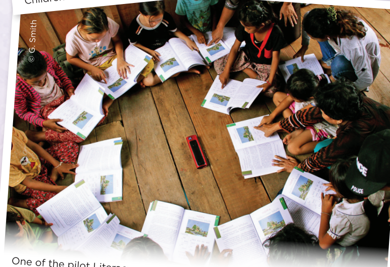
One of the pilot Literacy programme classes run in Cambodia.

I get to listen to God’s Word. For me, this is such a blessing: it makes me happy and I feel peace and joy. God has been so good to my family!”