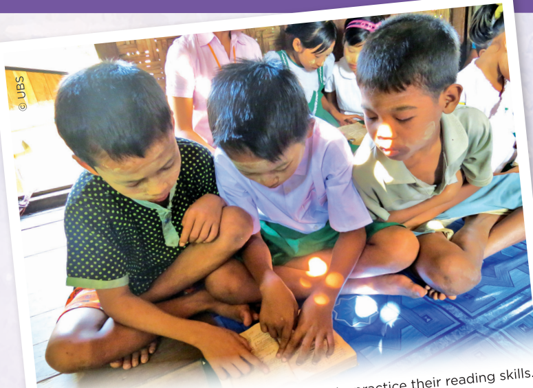
Children in Myanmar having to share books to practice their reading skills.

Support the Bible mission by giving generously