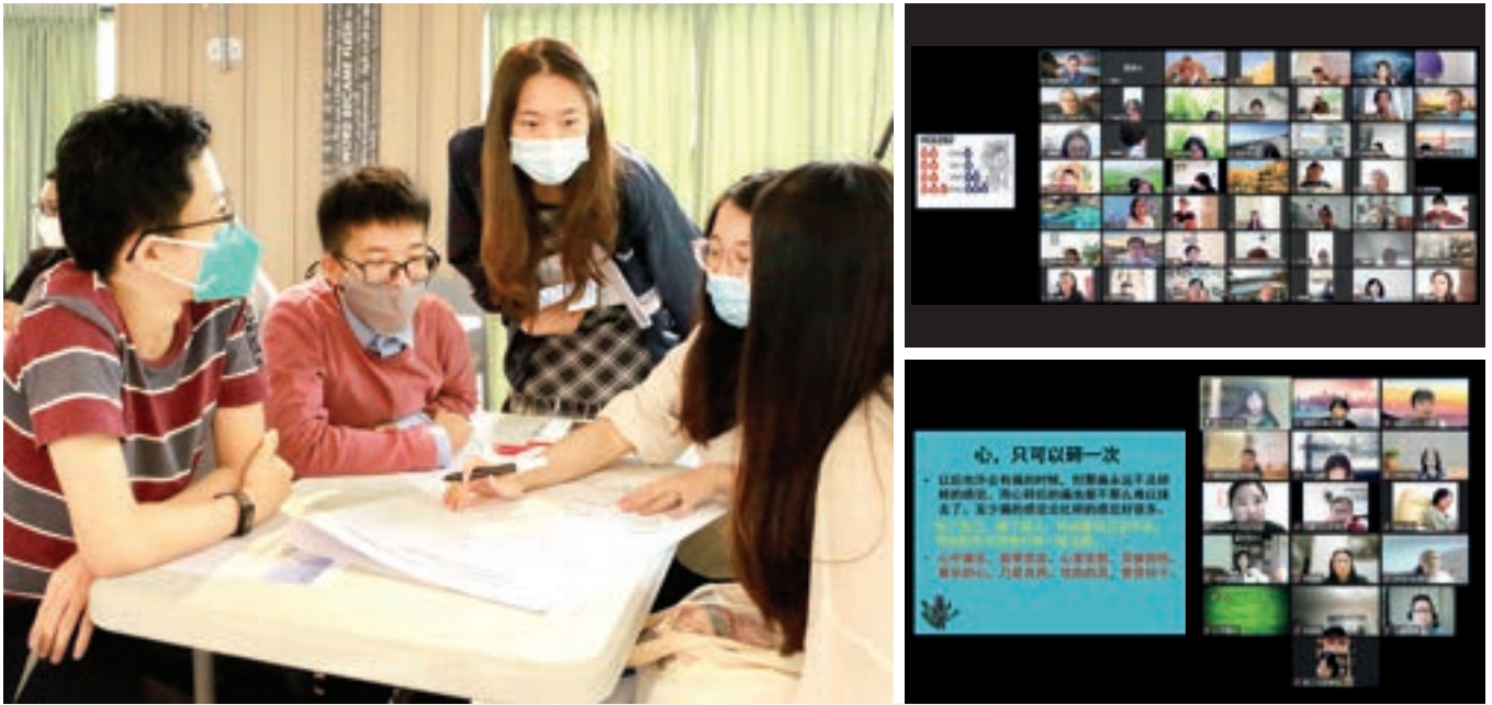
(Left): Passionate youths and youth group leaders gathered to explore youth and faith related topics at YOUTh-reka. (Right): Virtual lectures and workshops were conducted by the Chinese track of Sower Institute for Biblical Discipleship during the pandemic.