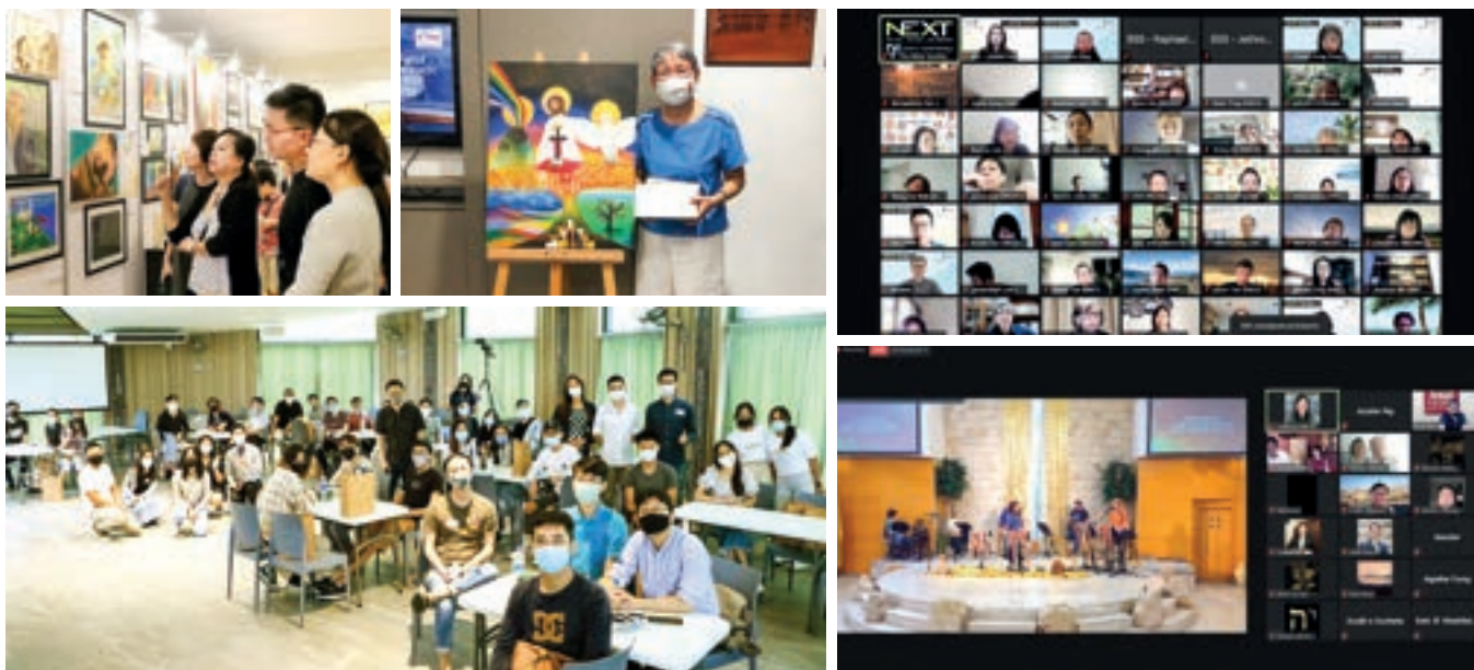
(Top Left & Centre): Colours of the Bible —an annual art competition and exhibition—will be held throughout the year. (Bottom Left): YOUth-reka is the first of many initiatives that the Youth Ministry of the Bible Society has organised for this year. (Top Right): The annual conference of D6 2022 will follow the theme of ReCalibrate this year. In 2021, over 520 local and overseas participants joined the online conference on Zoom. (Bottom Right): DECLARE —a national Bible reading event—will be held in June this year.

everyone to take on life’s challenges and live the life that God has intended us to live. On that note, the Bible Society has relaunched in-person Bible engagement programmes in April, following two years of shifting to digital initiatives due to COVID-19 regulations.