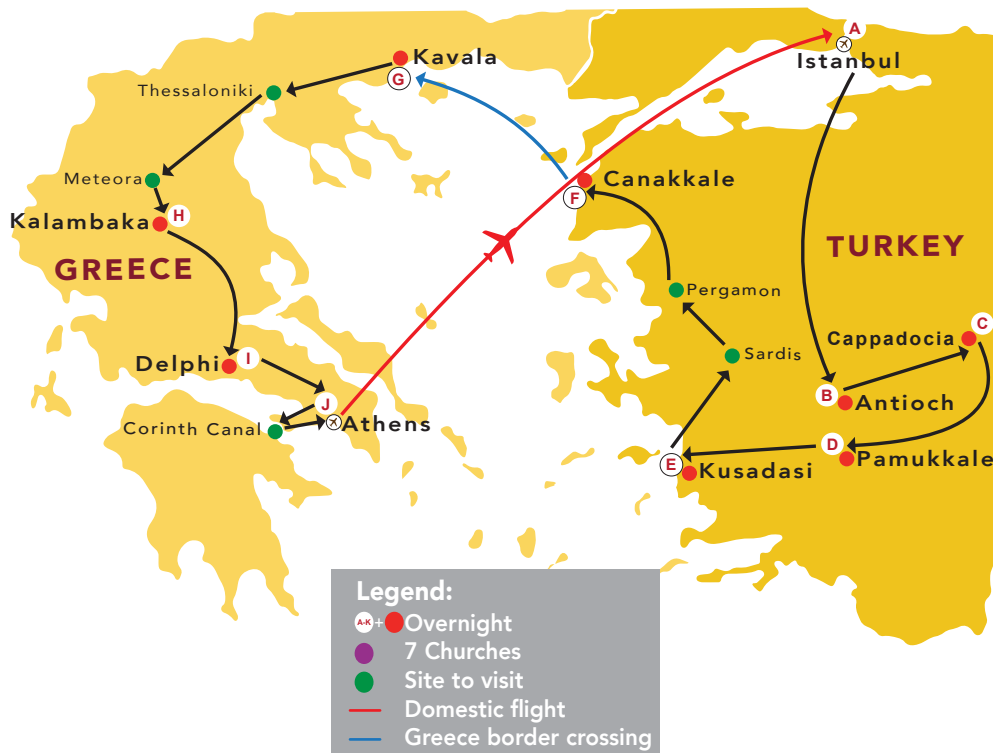
*Map not drawn to scale. For information only.