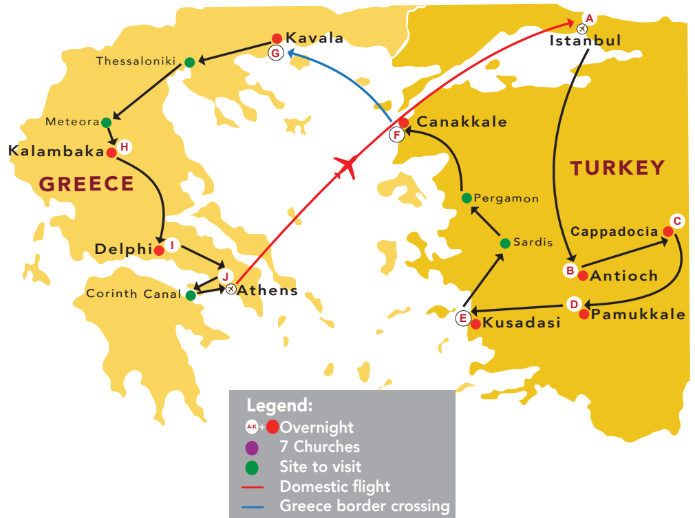
*Map not drawn to scale. For information only.