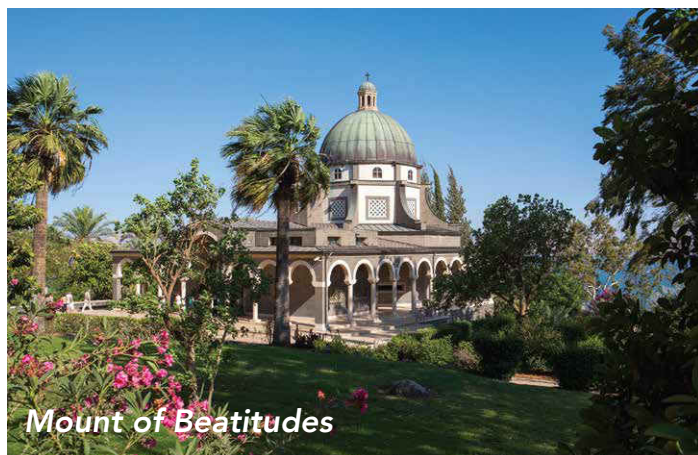
Mount of Beatitudes

See the Dome of the Rock located on Temple Mount , one of Jerusalem's most recognisable landmarks. Visit Church of St Anne , the Pool of Bethesda where the healing of the lame