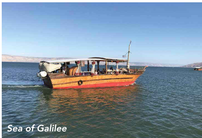
Sea of Galilee

This morning, visit a local church and their Sunday morning service (TBC). Then, we will drive up to Mount of Olives to see the panoramic view of the Old City. Walk along Palm Sunday Path* to Dominus Felvit Church – the teardrop church that commemorates the weeping of the Lord when he observed Jerusalem. See the Garden of Gethsemane with the ancient olive trees believed to date back to the time of Christ and visit Church of All Nations . Optional in the evening: Light and Night Show (at additional cost). (B/L/D)